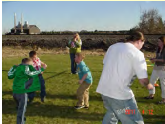
WELC: April 12, 2011 was our 4 th annual Dads and Kids Olympics. The evening started with a

family meal and then we went outside to start the fun. The athletes participated in a sack race, egg race, and obstacle course. After completing all three activities the athletes received a gold medal!